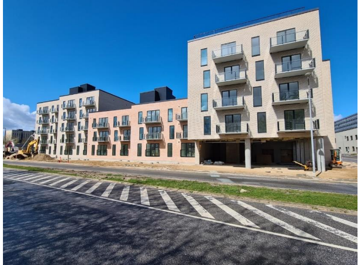
Figure 1 & 2: Ryhavevej 28, Aarhus in the construction phase.